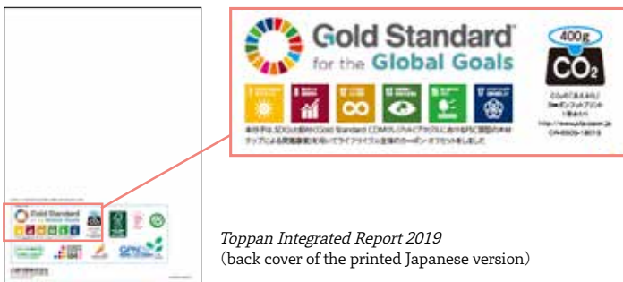
Toppan Integrated Report 2019 (back cover of the printed Japanese version)

https://www.cfp-japan.jp/common/pdf_permission/001740/CR-BS05-19007.pdf